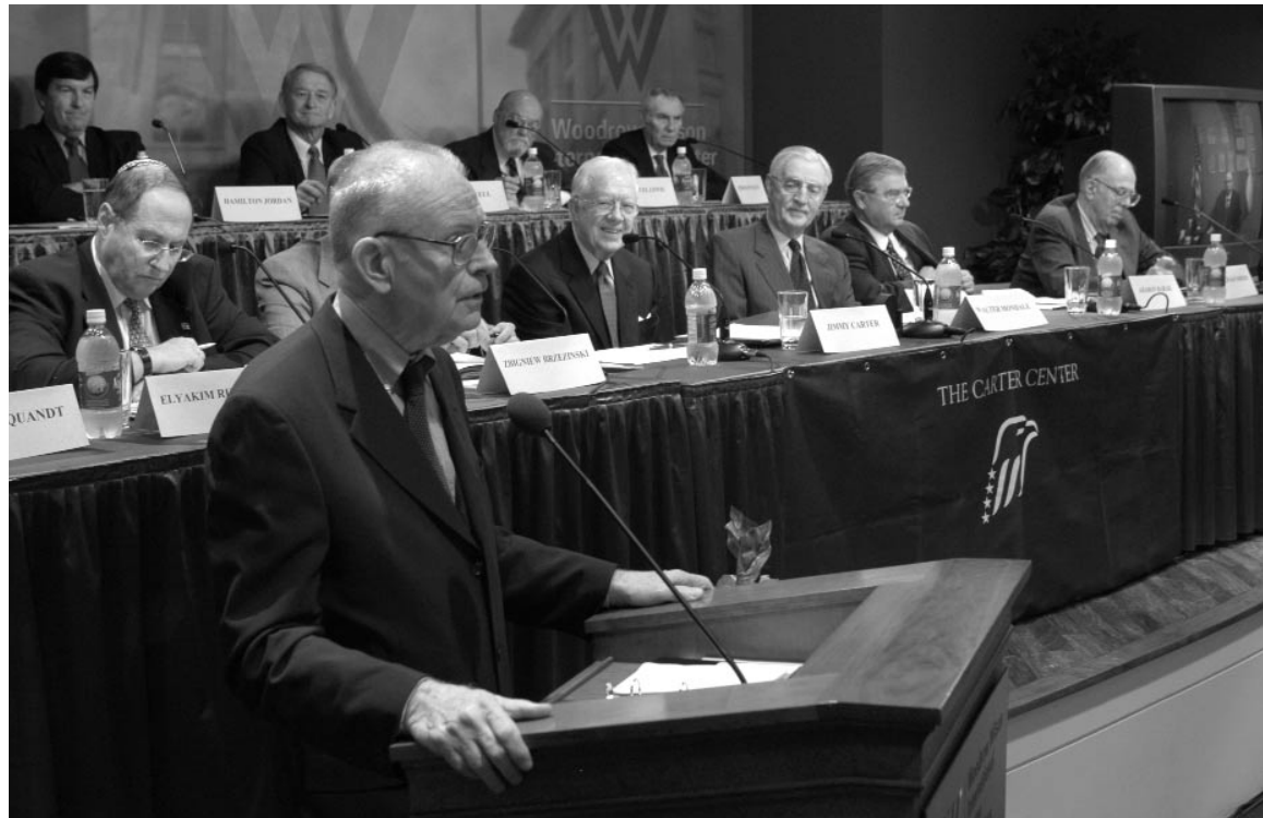
Lee Hamilton and panel

It is now my honor to say a few words of introduction for President Jimmy Carter. President Carter has lived a