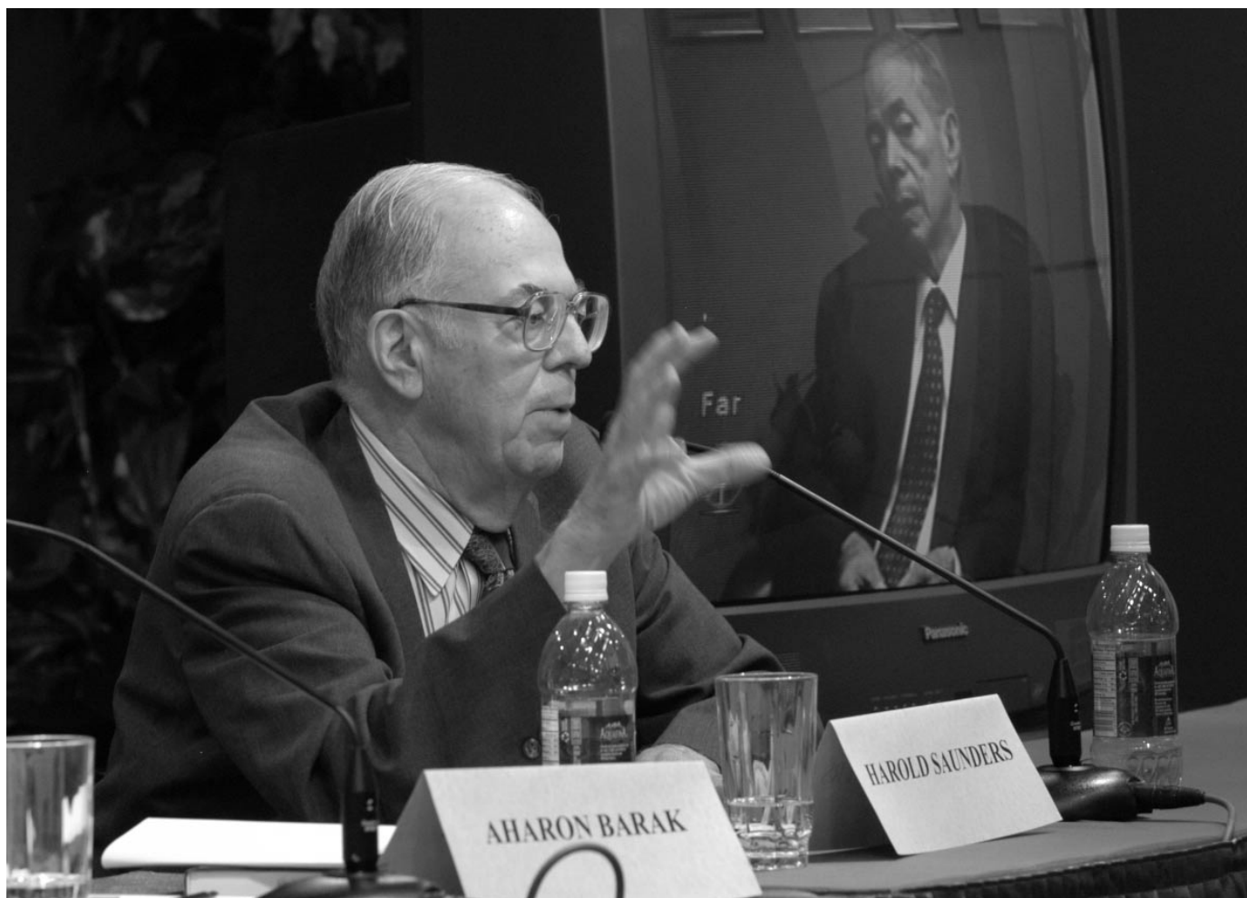
Harold Saunders. Dr. Osama el-Baz on screen.

later, I said, “The peace process, when it worked in the 1970s, was a progression of mediated agreements embedded in the larger political process, and it was in that larger political process that relationships could actually change. The power to change lay in the political process itself.”